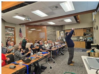
Applying a tourniquet